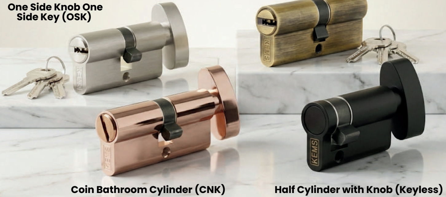
Coin Bathroom Cylinder (CNK)